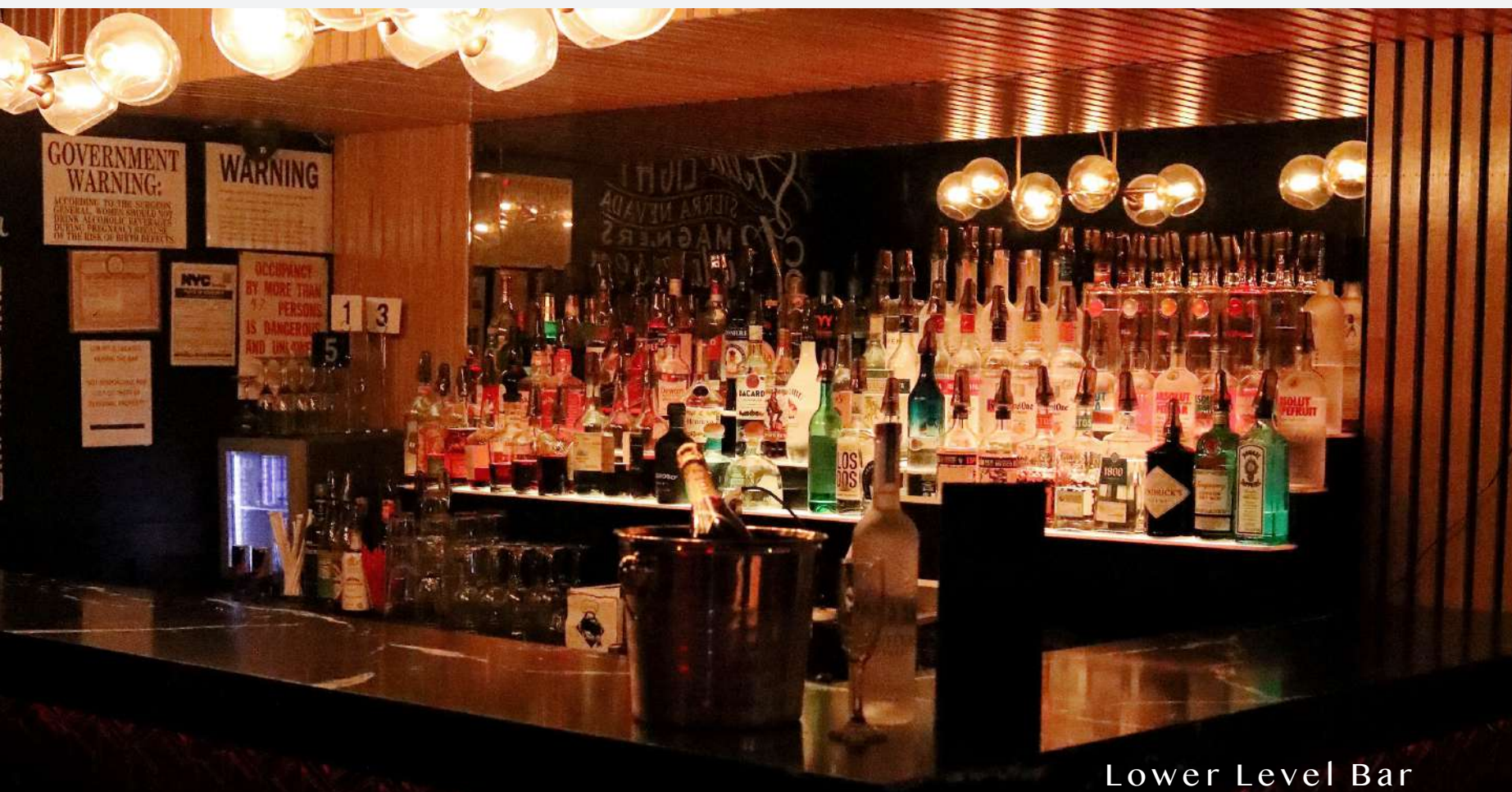
Lower Level Bar